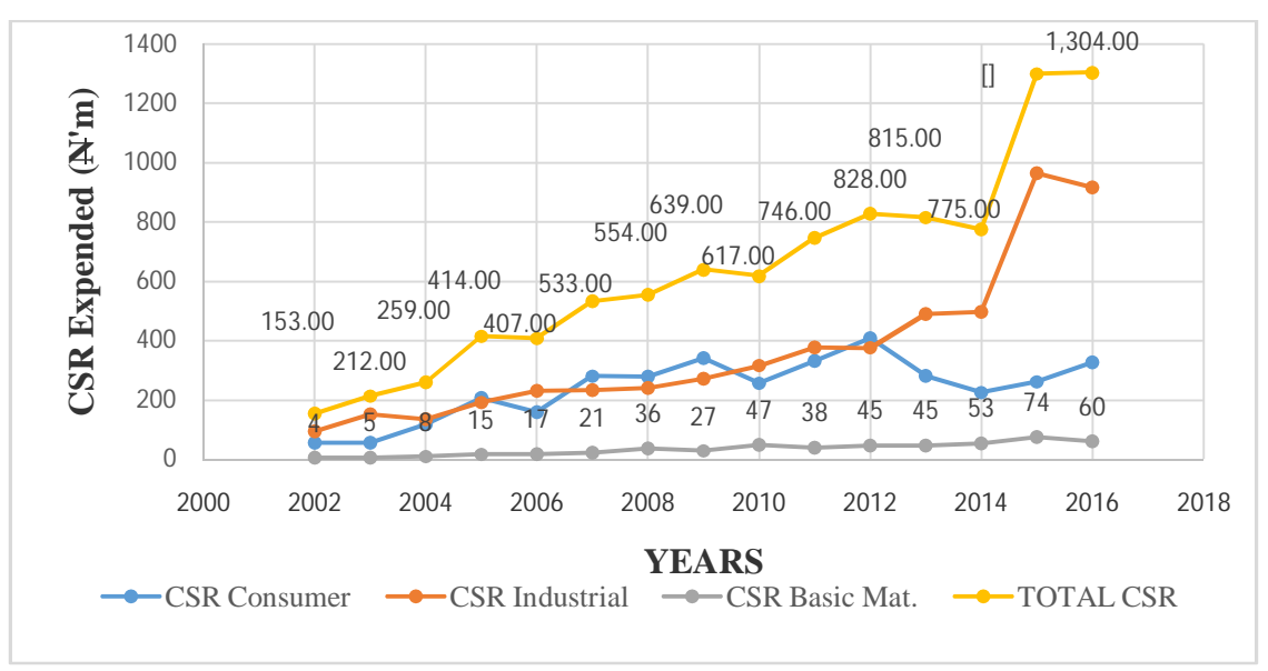
Figure 2: Trend Showing CSRof the Manufacturing firms base on Sectors